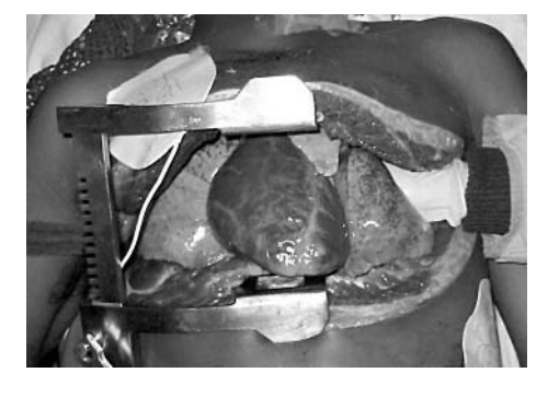
Figure 3 Open chest. Rib spreaders in situ. Central heart. In this picture the pericardium has been displaced by internal cardiac massage and lies behind the heart. Gloved hand compressing the aorta.

The procedure and equipment used to perform a thoracotomy in a cardiothoracic operating theatre is highly specialised. To