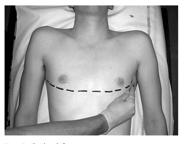
Figure 2 The clam shell incision.

ensure that the heart remains horizontal during massage. Lifting the apex of the heart too far out of the chest can prevent venous filling. An assistant can compress the aorta against the spinal column using a thumb or fingers to maximise coronary and cerebral perfusion (fig 3).